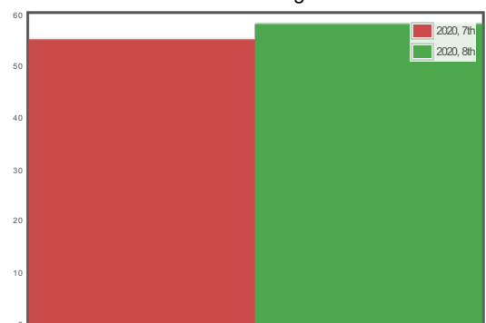
Honor Roll Recognition

The Del Sur SST members take pride in the efforts of our students' achievements and acknowledges their significant importance to college readiness. All 7th and 8th grade students may earn Honor Roll Awards. Honor Roll is given to all students reaching a 3.0 and above. A study skills elective class is now offered for students in need of extra support to achieve that academic goal. The graph on the right illustrates honor roll awards received for the first semester of this school year: Fifty-five 7th grade students, and fifty-eight 8th grade students received honor roll awards.