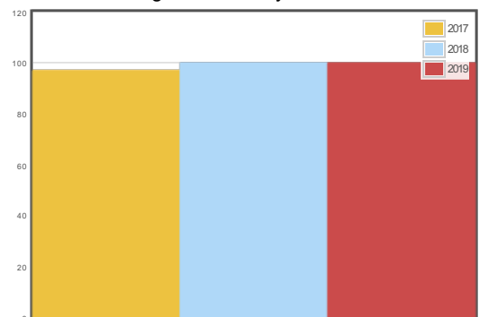
Achieving Academically at Grade Level

This graph illustrates the number of 8th grade students achieving at grade level the past three years. Students must have above 2.0 GPA and no F's to promote to high school. The 8th grade promotion rate was 97% in 2017, and has remained at 100% the past two years. The SST executed data driven interventions such as monthly academic check-ins by the counselor, at risk letters sent home quarterly, tutoring during lunch, and intensive parent/guardian communication. AHS offers Strategies for Success as an elective, where 45% of our middle school students strengthen AVID skills such as organization. Our SST also took a proactive role in preparing students for the PSAT this year by delivering lessons, videos, and grade-level practice tests. AHS students' scores increased by 2.1% in meeting both the math and reading objectives.